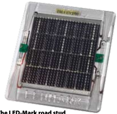
The LED-Mark road stud

"It has both an environmental and a health effect if we are able to make the citizens of Aarhus choose the cycle over the car," Celis explains. "It's not based on any moralistic views about making everybody in Aarhus cycle to work every day; we know this is not possible. But if we improve conditions for cyclists, it will be a whole lot easier for them to choose two wheels over four. On top of this, we hear from cyclists that dark cycle paths are an issue when it comes to cycling to work, which is why we felt we had to do something about it. However, the costs involved in installing and maintaining such lighting systems can be considerable, more than €40 per meter, so we were really