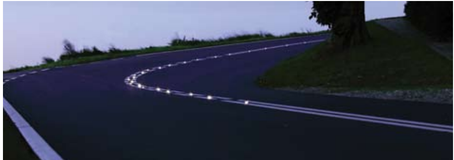
Geveko ITS LED road studs installed in Aarhus, Denmark

happy to learn that it is possible to solve our problem with a technology that is only one tenth of that cost."